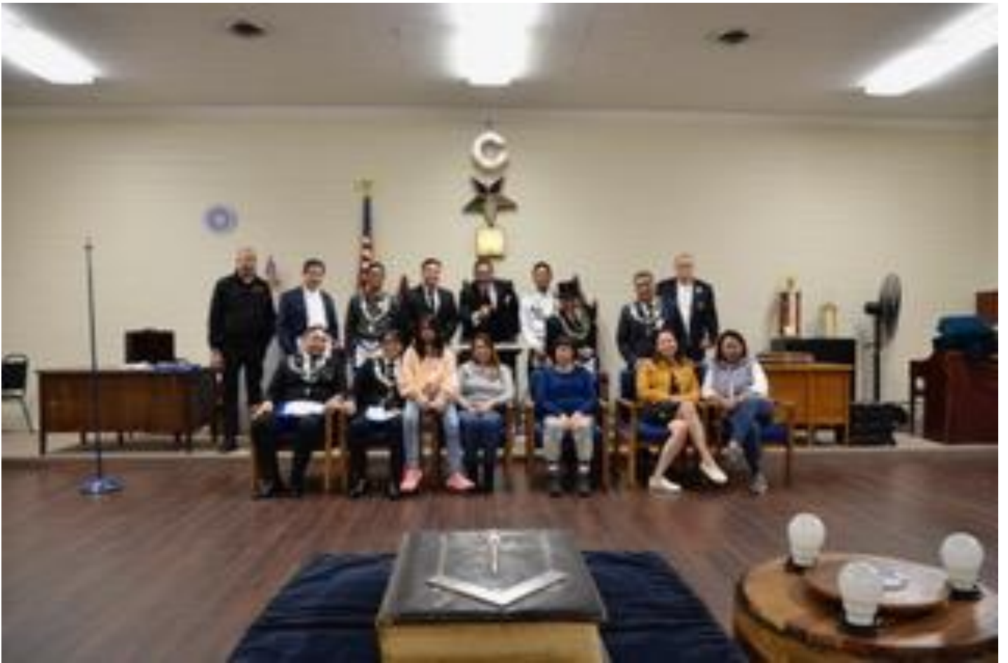
Christmas Party Pictures